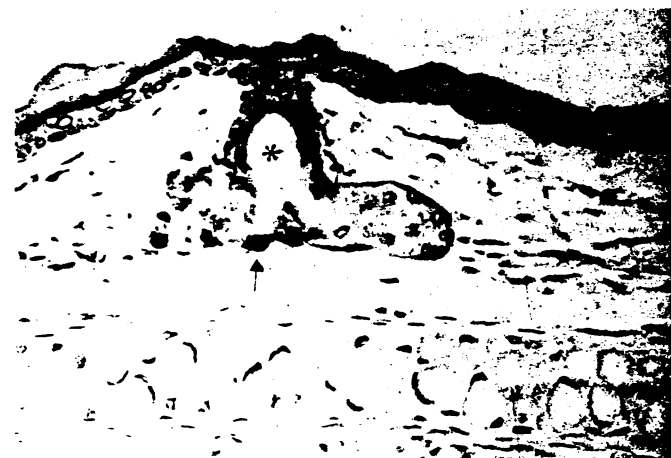
FIG 3. Pronounced reduction of sebaceous follicles with cyst-like cavity (*) in Syrian hamsters treated with 2.0 mg spironolactone daily. Few labeled sebocytes ( \uparrow ) (reduced from \times 220 ).