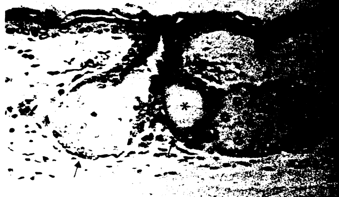
FIG 2. Reduction of sebaceous follicles with intralobular cavity (*) in Syrian hamsters treated with 0.5 mg spironolactone daily. Few labeled sebocytes ( \uparrow ) (reduced from \times 220 ).